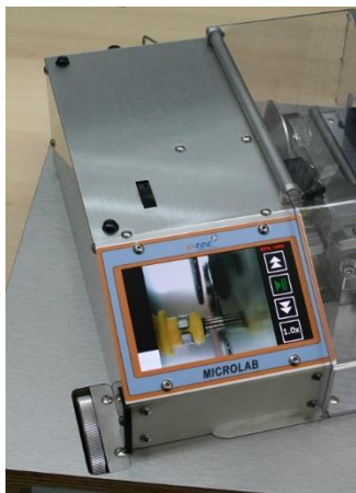
Cut control with an optional Cut Camera (VCS)