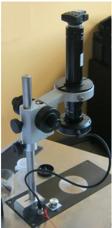
Optic with camera