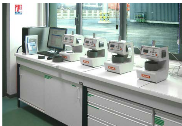
4 AUTOVICAT linked to PC via WinLect32 - VICATEST software