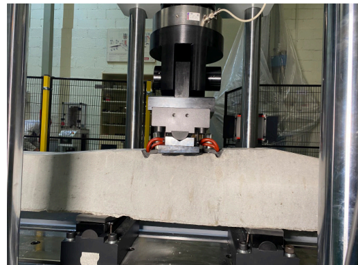
View of a sleeper during the under-rail section fatigue test